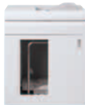
High Capacity Stacker (Single or Dual) up to 5,000 Sheet Removable Cart (Top Tray 500 Sheets)