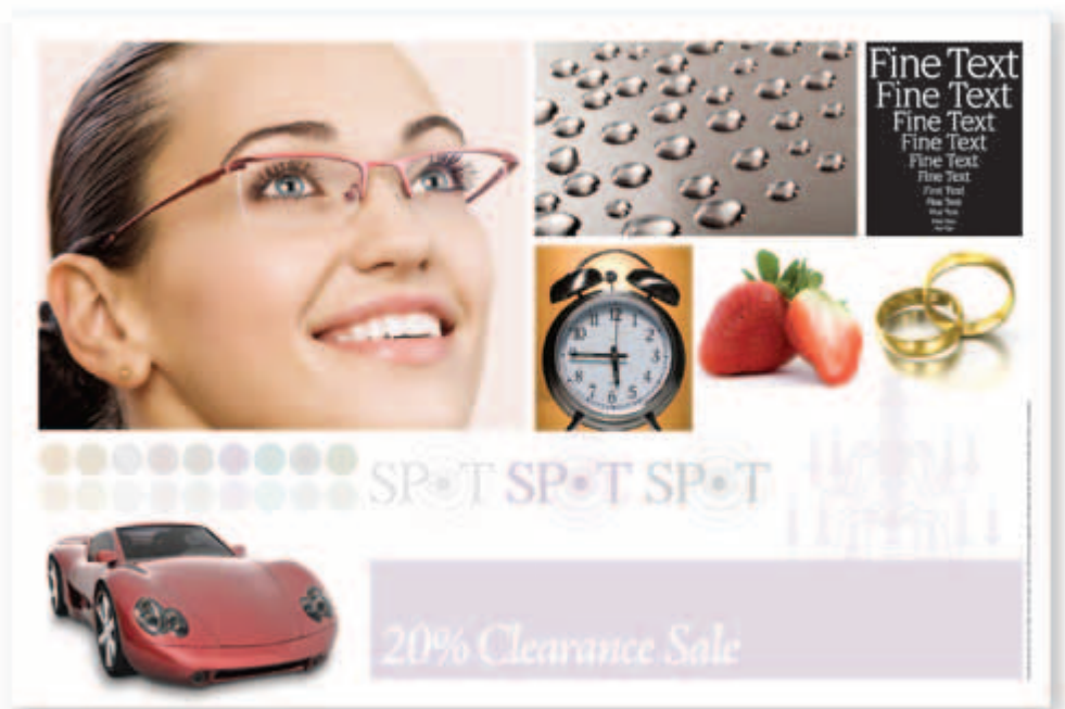
Base image without clear dry ink areas.

The creative options you can offer by adding this new, clear dry ink capability can help you become a true partner to your customers. You can advise customers already expert in design and layout on how to set up their files properly for this additional clear layer to achieve their desired effect. Or you can offer creative value to customers when they deliver their files, by adding some of these effects right at your print server.