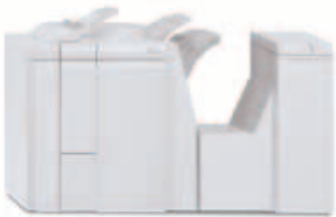
Standard Finisher Plus. With Optional C-Z Folder plus DFA (Document Finishing Architecture) required to support additional finishing options