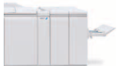
PlockMatic Pro 30 Booklet Maker