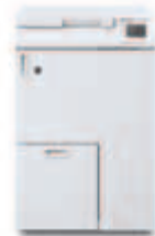
GBC® eBinder 200™