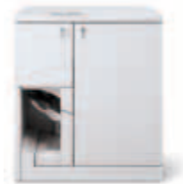
Xerox Tape Binder