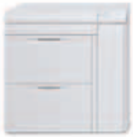
Optional High Capacity Feeder