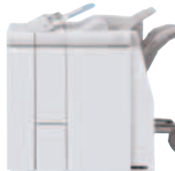
Booklet Maker Finisher with Optional C-Z Folder (25 sheets or 100 page booklets)