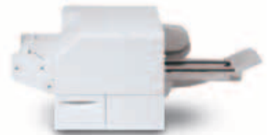
Xerox® SquareFold® Trimmer Attaches to the optional Booklet Maker Finisher

From high capacity stacking, hole punching and folding to square fold booklets and layflats, our array of finishing options add polish to all your applications.