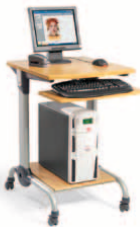
EFI Fiery® Colour Server