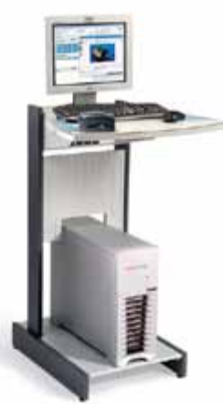
Creo Spire™ Colour Server