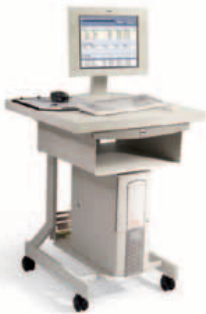
FreeFlow Print Server (Stand is optional)