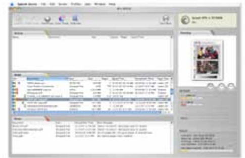
EFI Splash RPX-ii Colour Server

The DocuColor 5000AP combined with one of our powerful print servers – Xerox FreeFlow Print Server, Creo®, EFI® or Splash® – offers exceptional performance and productivity with a solution as unique as your business needs. While the print servers are distinctly different and your choice will depend on your workflow and applications, they share some important values. Each uses industry-standard hardware and software to integrate with your existing workflow, supports VI solutions that will expand the jobs you are able to fulfil, and is designed to support universally accepted PDF and Postscript® file formats. They handle output from popular software tools such as QuarkXPress®, Adobe® Creative Suite, Microsoft® Word, and Microsoft Publisher, while also supporting VI printing, job management and job ticketing.